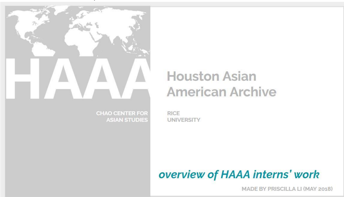
HAAA intern training guide, by Priscilla Li.

creation of transcripts and time syncing, to the creation of interviewee pages on the haaa.rice.edu website. The program now has one training document which can be used and updated annually as needed. The document includes links to more detailed instructions which can be accessed as required.